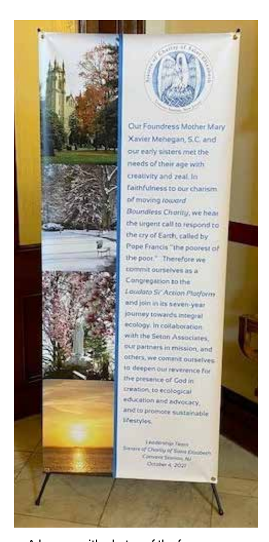
A banner with photos of the four seasons at Sisters of Charity properties proclaims our commitment to the Laudato Si' Action Platform in the reception area of the Motherhouse.

The Sisters of Charity, Seton Associates and friends have a monthly Ecospirituality Group that meets to pray and reflect on our call to care for creation as people of faith. If you would like to join, send your request to tmoran@scnj.org All are welcome!