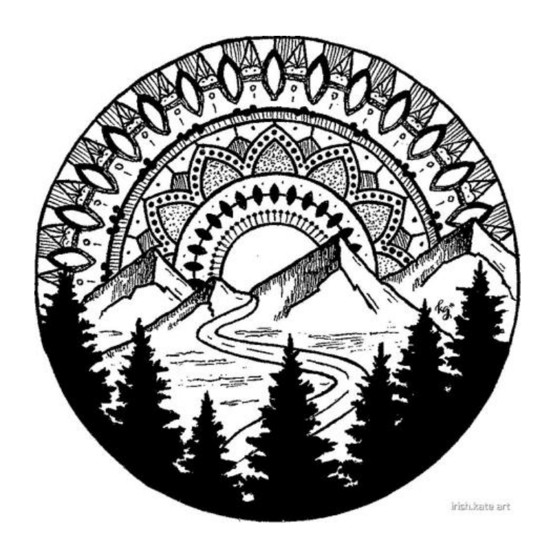
Earth Day Prayer Service