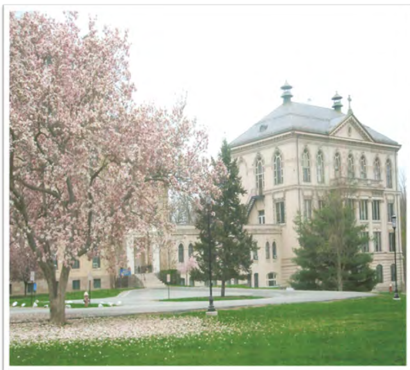
The Academy of Saint Elizabeth

Take time to relax and trust in the Presence of God. Reflect on all that you have learned.