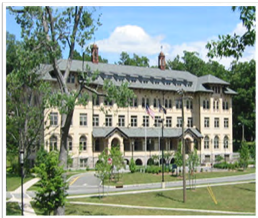
Santa Rita Hall, Saint Elizabeth University

Take time to reflect on all that you have seen and the miracles of vision within your own life. Be present to a sense of gratitude for all that you have.