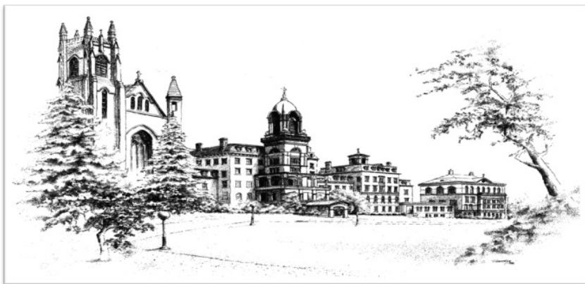
Motherhouse of the Sisters of Charity of Saint Elizabeth

Take time to rest in the peace of knowing that God is with you.