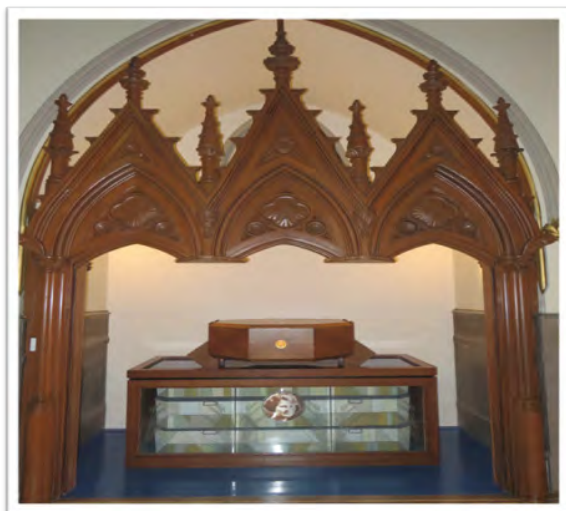
Shrine for Blessed Miriam Teresa at Holy Family Chapel

Use the walk as a Visio Divina for nature. As you are walking what elements of nature speak to and inspire you? Let a connection with the natural world nourish your mind, body, and spirit.