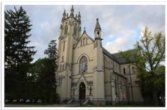
Holy Family Chapel

Take a moment to pause with mindful awareness and pray. See what words come to you. Use this contemplative walking journey and exploration of the life of Blessed Miriam Teresa to be a Lectio Divina to see what words, phrases, or moments of her life speak to you and inspire you.